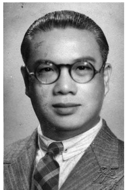
My Eighth Grandaunt and Granduncle

My grandaunt must have noted my lean and hungry look during the course of the evening, for she said earnestly upon my departure: "Don't stand on ceremony. We're all family. Come around for a meal whenever you feel like it. It will be just a simple matter of setting out an extra pair of chopsticks."